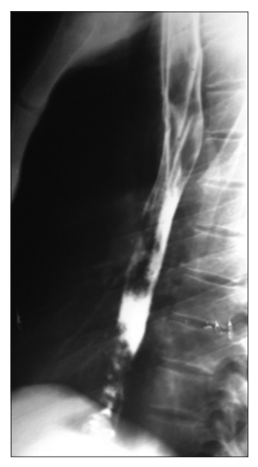
Fig. 2 Barium oesophagogram shows oesophageal duplication.