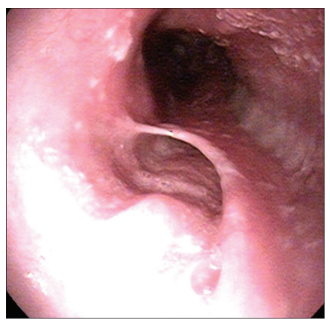
Fig. 1 Endoscopic image of the oesophageal duplication shows two lumina.

A 32-year-old man presented to our tertiary care hospital with a two-month history of progressive dysphagia to both solid and liquid intake. He had no relevant past history other than occasional