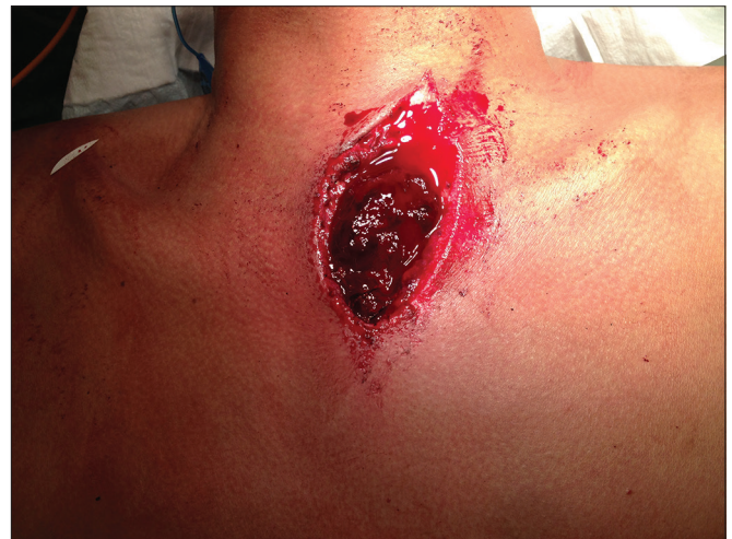
Fig. 1 Photograph shows the open anterior chest wall wound with the fibreglass sheet in situ .

The patient was transferred to our hospital with the fibreglass sheet in his chest. He was brought emergently to the operating room for removal of the fibreglass sheet. The penetrating wound was extended to incorporate the upper half of the sternum in the midline, and a partial sternal split was performed for easy removal of the foreign body (Fig. 3). We noted a mediastinal haematoma, no injury to the right innominate artery or left innominate vein, and intact pleurae. The mediastinum and wound were irrigated with copious amounts of warm saline and the sternum (including the fractured manubrium) was closed with sternal wires. The wound was closed in layers, and skin closure was done using interrupted vertical mattress sutures. The patient made an uneventful recovery and was discharged on Day 4 postsurgery. He was reviewed in