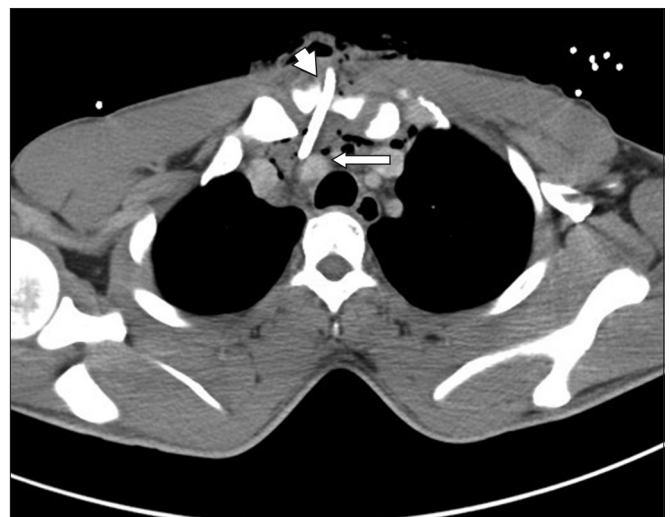
Fig. 2 Axial CT image shows the foreign body traversing the manubrium (arrowhead) and resting within the anterior mediastinum, and the tip of the foreign body abutting the right innominate artery (arrow).

the outpatient clinic a month later, where it was noted that his wound had healed and he had returned to work.