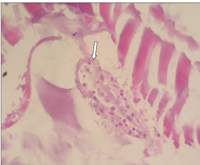
Fig. 4 Photomicrograph shows the cuticle material and daughter cyst of the mass lesion (Haematoxylin & eosin, 40 × 10).

images. In both CT and MR imaging, peripheral rim contrast is seen after the injection of a contrast medium. (1,6) Coronal