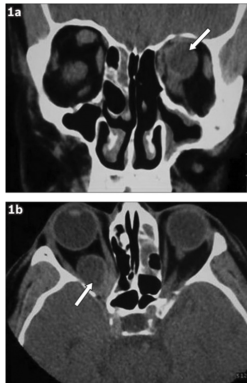
Fig. 1 (a) Coronal and (b) axial CT images show the well-demarcated, intraconal cystic lesion (arrows) localised in the posterosuperior region of the right bulbous oculi.

Hydatid cysts are most commonly located in the liver (60%–70%) and the lungs (20%). (3,4) The orbita is a rare location for echinococcal infestation and makes up less than 1% of all cystic involvements. (5) Hydatidosis of the orbit is more common among young adults and children. (6) Other systemic involvements are rare in cases of orbital hydatid cyst. Orbital involvement is usually unilocular, without right or left dominance. (2,3) The cysts are usually located in the retrobulbar region, and may be