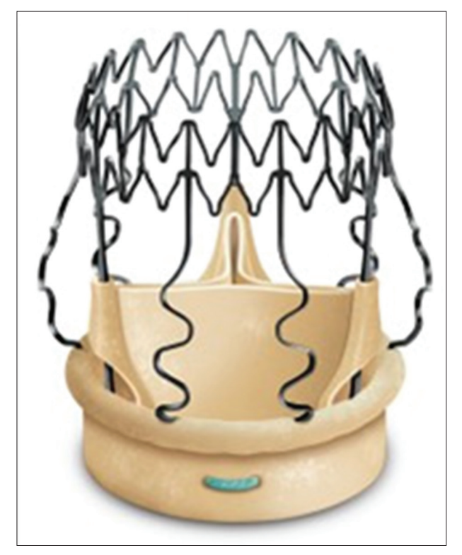
Fig. 1 Photograph shows the Sorin Perceval S.

Access to the aortic valve was achieved via median sternotomy in five patients. In two patients, a minimally invasive approach (via mini-sternotomy) was used. In all patients, the sutureless Perceval S aortic valve was implanted using three Prolene 4-0 guiding sutures. Positioning was then confirmed by inspection before removal of the guiding sutures. Subsequently, the basal annulus was dilated using the Perceval S large balloon inflated to 4 atm for 30 s. The mean cardiopulmonary bypass time and mean aortic cross-clamp time were 99.4 \pm 37.8 min and 84.1 \pm 42.3 min, respectively. The sizes of the Perceval