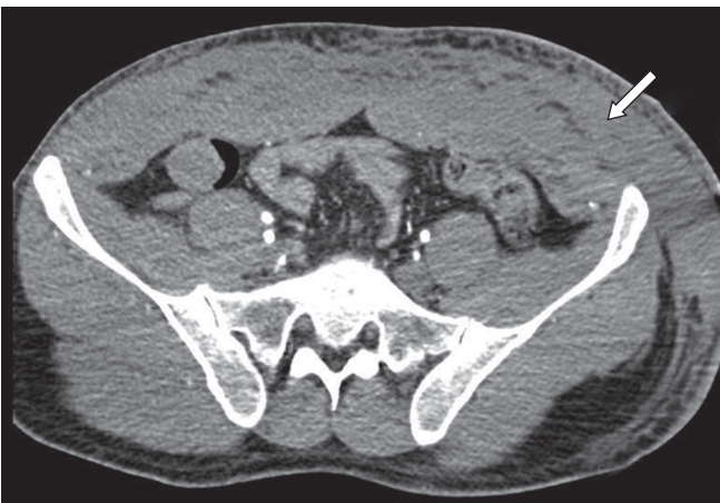
Fig. 2 Transverse mesenteric CT angiogram done 24 hours after presentation to the emergency department shows an increase in the size of the subcutaneous haematoma (arrow).