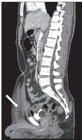
Fig. 3 Sagittal mesenteric CT angiogram done 24 hours after presentation to the emergency department shows an increase in the size of the subcutaneous haematoma (arrow).

and Enterobacter . Following a further ten days of antibiotics, the post-drainage wound defect was covered with a split-skin graft. The patient's fever resolved and he was discharged to a step-down care facility shortly after. At review six months after the accident, the patient was fully ambulant and the surgical wound on his left thigh had healed completely.