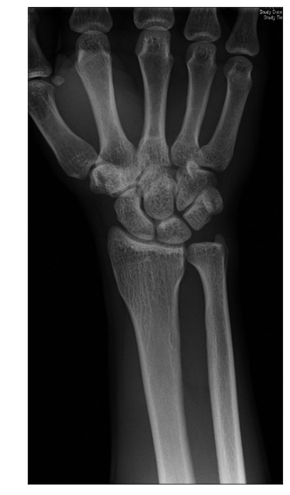
Fig. 1 Anteroposterior radiograph of the right wrist shows a fracture of the triquetral body.

Under regional anaesthesia, wrist arthroscopy was first performed through the 3/4 and 6R radiocarpal port sites, revealing