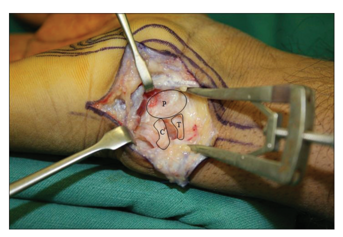
Fig. 4 Intraoperative photograph shows the wrist. C: capsule with triquetrum fragment; P: pisiform; T: triquetral fracture

The pisotriquetral joint describes the dorsal articulation between the pisiform and triquetrum. Flat and ovoid in shape, the joint derives its stability from soft tissue attachments such as the FCU tendon, ulnar pisotriquetral ligament, and the pisometacarpal and pisohamate ligaments.<sup>(4,5)</sup> The pisotriquetral joint is tightly contained within both the transverse carpal ligament and the ulnar collateral ligament.<sup>(6)</sup> Disruption of the pisotriquetral joint can occur secondary to direct trauma, or from traction caused by the FCU tendon either during a fall on a dorsiflexed wrist or while lifting heavy objects.<sup>(7,8)</sup>